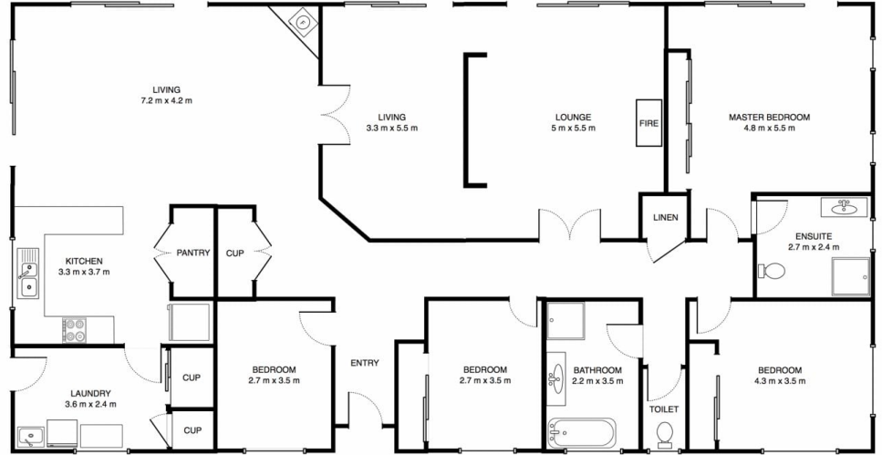
MAIN LEVEL [ Approx Floor Area 220m 2 ] [ Garage 62m 2 ]